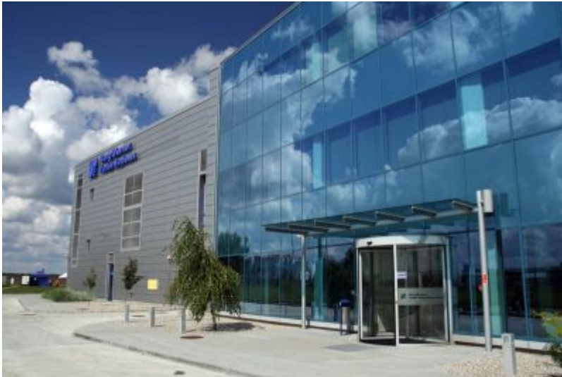
Borg Warner Poland