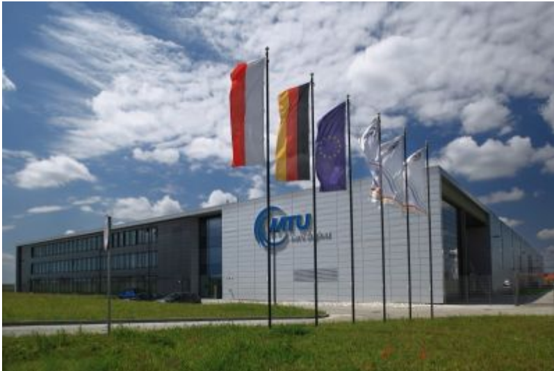
MTU AeroEngines Poland