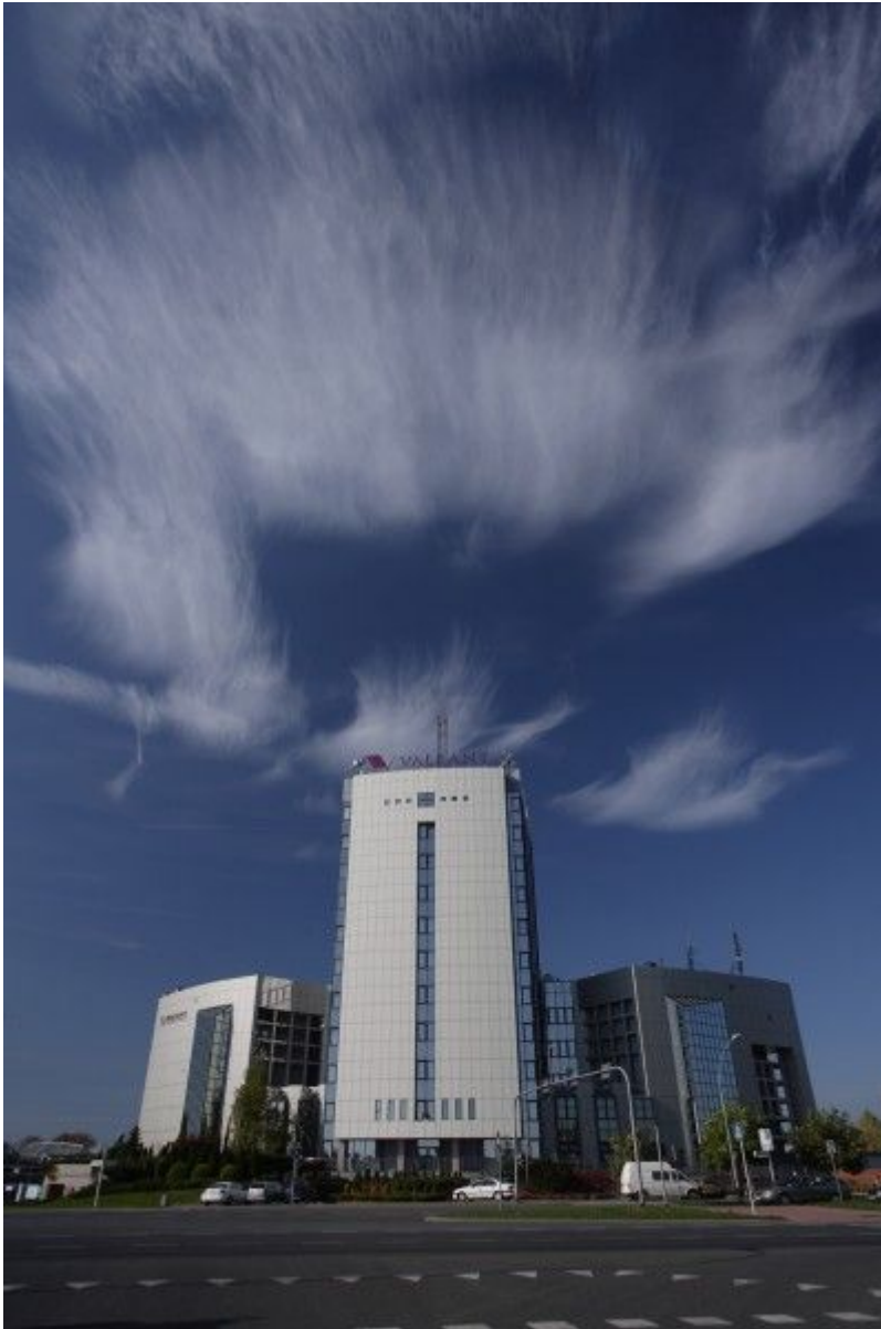
ICN Polfa Rzeszów