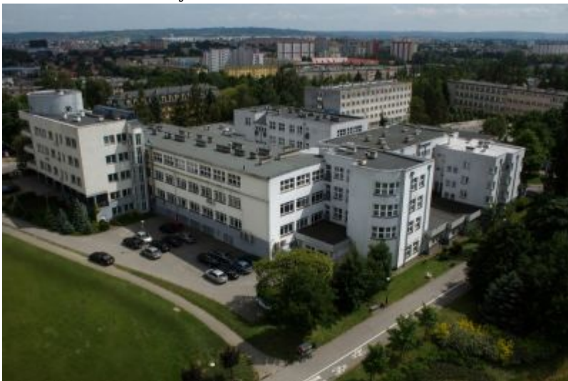
University of Information Technology and Management