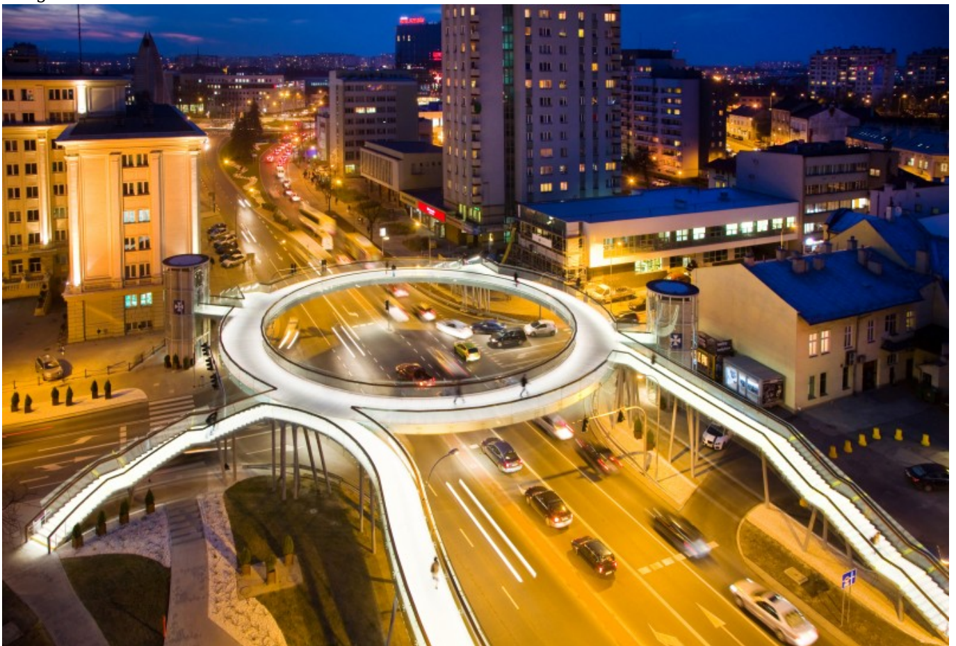
Kładka okrągła nad al. Piłsudskiego