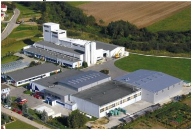
Marma Polish Films