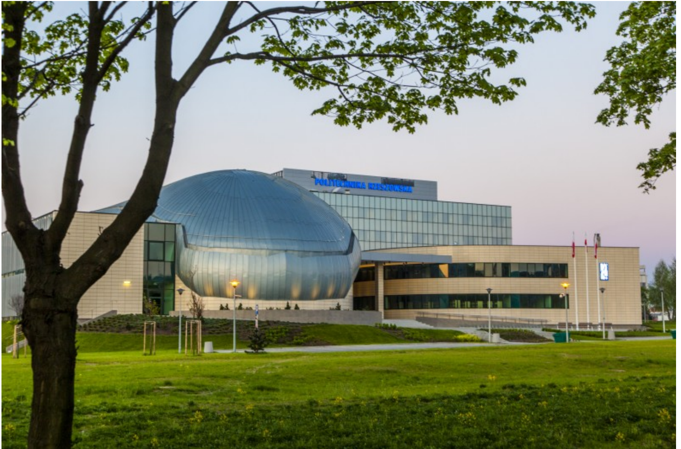
Rzeszów University of Technology